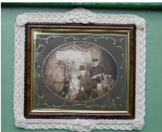
Decorative Picture frame using braiding, breastplate and flower knots