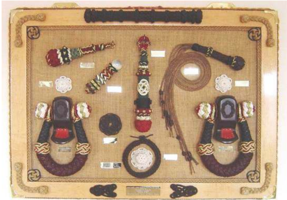
A Knot display made using the demonstrations from the tutorial "Knots Made Easy" showing two bell ropes, set of box handles, paper weight and flower knots, grommet or game rings, also a traditional cat-9-tails whip. This display has had the rope treated in wood glue and than hand painted to give a beautiful colour effect. Any person following the demonstrations of the Knots Made Easy tutorial can succeed in making any display such as this.