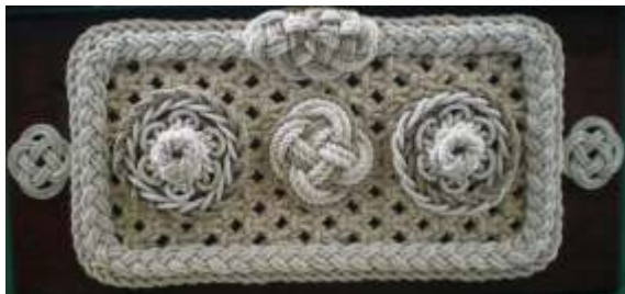
Jewellery box top lid display