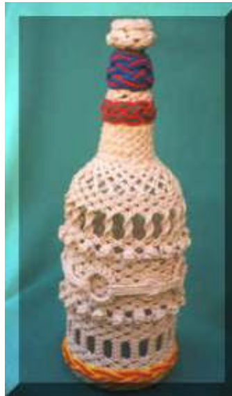
Decorative knot covered wine bottle