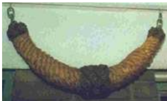
Boat Bow Fender