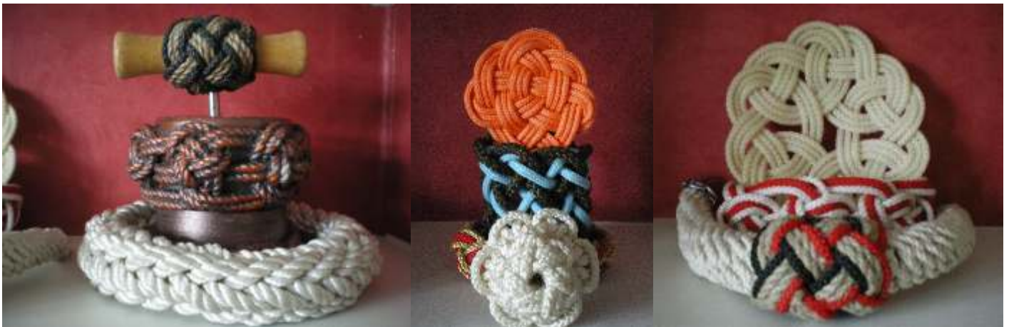
Cock screw, pencil holder and game ring, Bracelets and necklace