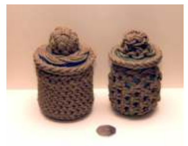
Decorated Small Jars