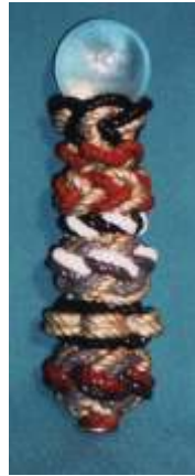
Glass Paper Weight