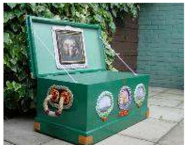
Transforming a box can add great value to your old furniture especially with ornate rope handles