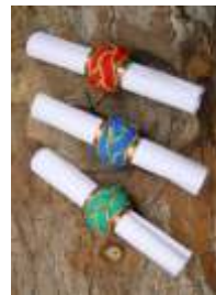
Serviette rings on copper pipes!