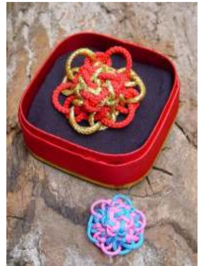
Brooch and ear rings